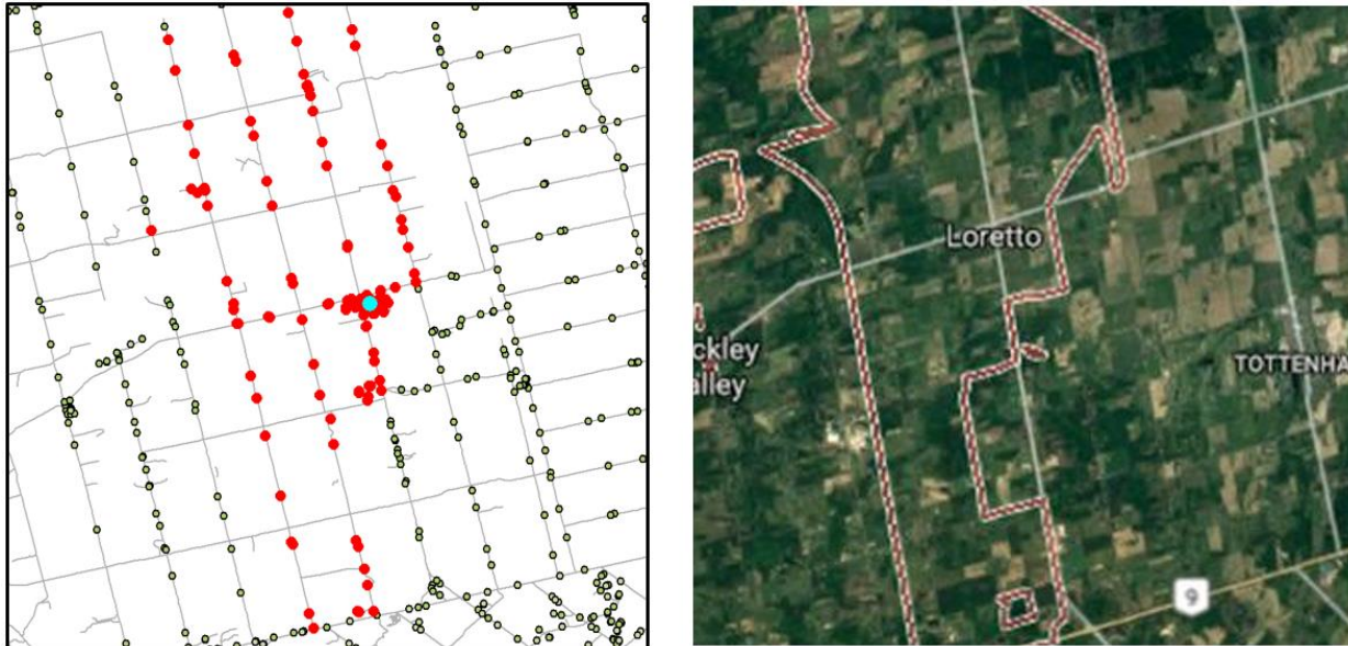
Figure 1. Postal codes with multiple locations (red dots) and the single link indicator (blue dot)

We see that in some cases, a single postal code can have multiple locations and cover a whole town, especially in rural areas – like this example of Loretto Ontario (Figure 1). Both PCCF and DMTI include multiple locations for the same postal code in cases like this – shown here as the red dots on the left, that fall within the postal code area shown on the right – 121 in total.